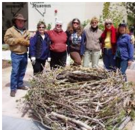
2010 Basket building at the State Museum in Carson City