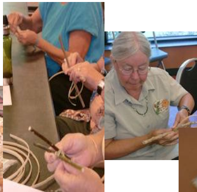
No idle hands in this bunch learning the "god's eye" at the August meeting

Important reminder Sep 15—No Workshop due to Flo Hoppe's Class on Sep 9, 10 & 11 The class is full.